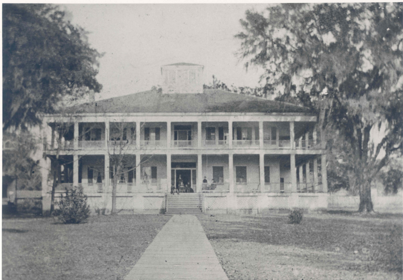
Date of Photograph - approximately 1900-1905 - Front elev.