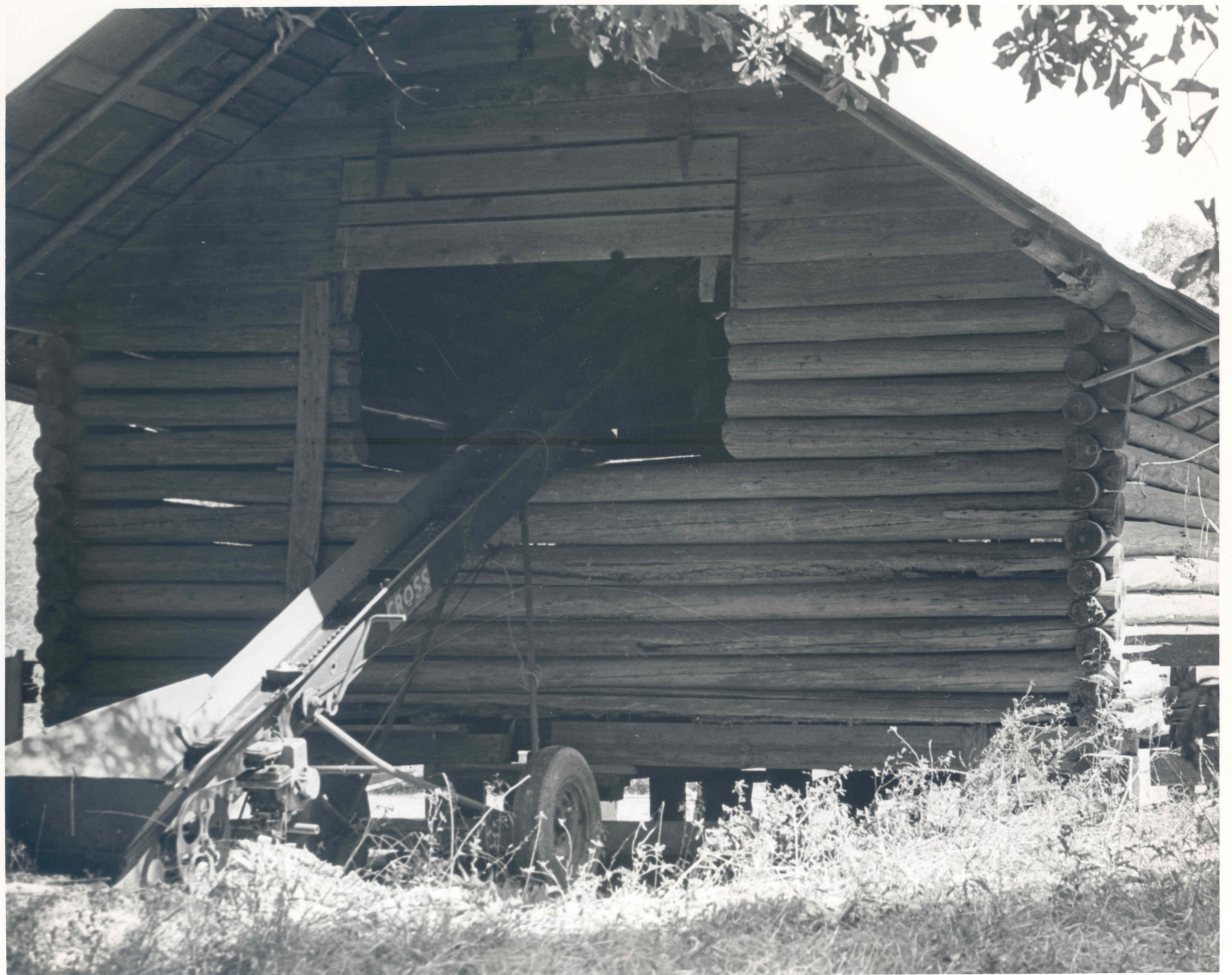
Structure No. 4