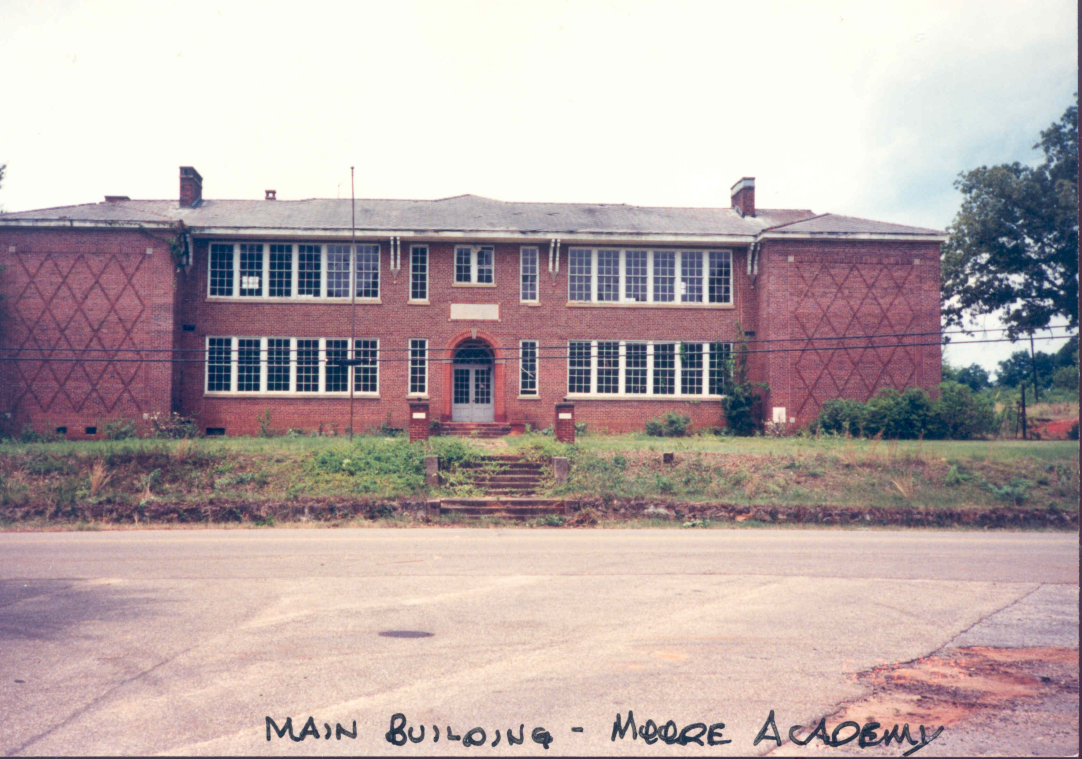
MAIN BUILDING - MOORE ACADEMY