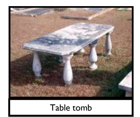
Table tomb (or Table stone) -- A type of grave monument in which a stone slab, usually at least two inches thick by about three feet wide by six feet long, is supported by six (or more) pillars or columns. The columns, or legs, are usually two to three feet high, in turn rest on a stone set on the ground. In most cases, an inscription is written on the slab top [ledger]; the stone columns are generally carved, sometimes ornately.#

Tabby -- A material comprised of oyster shell, sand, lime and water. Burning oyster shell in kilns fueled by wood fires made the lime for the mixture. Tabby was used primarily in coastal areas of Georgia, South Carolina and north Florida. The porous surface is covered with a coating of stucco to protect the exterior. In some cemeteries, tabby was used to construct walls around grave plots.