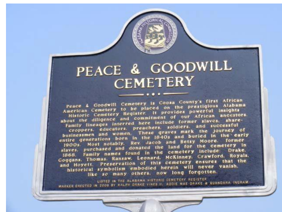
Historical Marker (Large 30”h x 42”w)