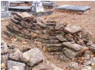
Rock Cairn -- A mound of stones erected as a memorial or a marker.

Relief carving -- Ornamentation projecting forward from a surface through shallow or, occasionally in gravestones, deep carving.#