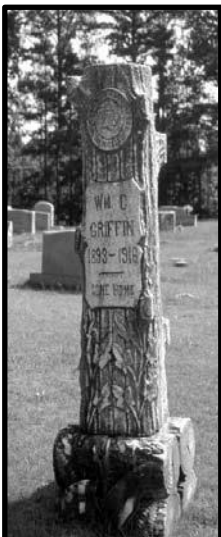
Woodmen of the World

White Bronze -- A material fairly popular for grave markers during the last decades of the nineteenth century, “white bronze” is almost pure zinc. When exposed to the elements, a protective blue-grey colored coating forms on the exterior. A number of companies made white bronze items, but the Monumental Bronze Company, based in Bridgeport, Connecticut, was apparently the only one that made grave markers. The firm had at least four subsidiaries, including one in New Orleans. The markers range from modest to elaborate and contain a variety of funerary designs popular during the time period. with the Woodmen of the World Life Assurance Society that historically provided an insurance rider to furnish memorial stones to its policyholders. Common in the States.