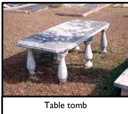
Table tomb (or Table stone) -- A type of grave monument in which a stone slab, usually at least two inches thick by about three feet wide by six feet long, is supported by six (or more) pillars or columns. The columns, or legs, are usually two to three feet high, in turn rest on a stone set on the ground. In most cases, an inscription is written on the slab top [ledger]; the stone columns are generally carved, sometimes ornately.#

Tabby -- A material comprised of oyster shell, sand, lime and water. Burning oyster shell in kilns fueled by wood fires made the lime for the mixture. Tabby was used primarily in coastal areas of Georgia, South Carolina and north Florida. The porous surface is covered with a coating of stucco to protect the exterior. In some cemeteries, tabby was used to construct walls around grave plots.