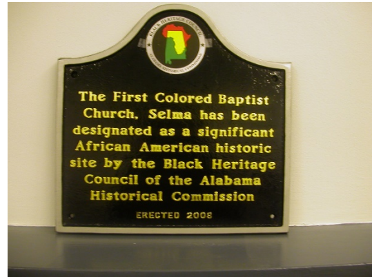
BHC Historical Plaque (16”h x 16.5”w)