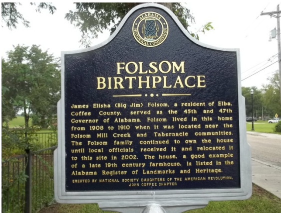
AHC Historical Marker (Small 24”h x 30”w)