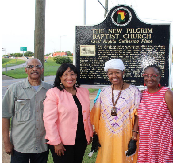
Marker with Photograph (Large 30”h x 42”w)