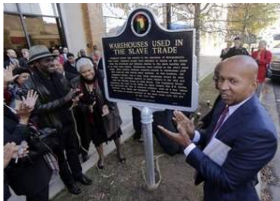
BHC Marker (Large 30”h x 42”w)