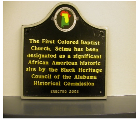
BHC Historical Plaque (16”h x 16.5”w)