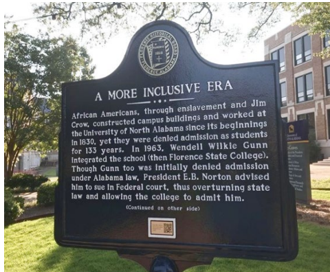
Marker with QR Code