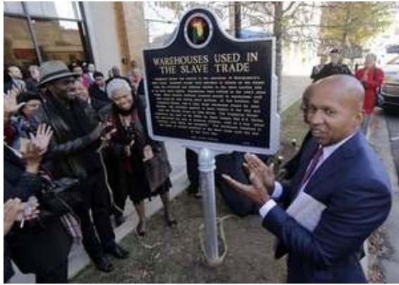
BHC Marker (Large 30”h x 42”w)