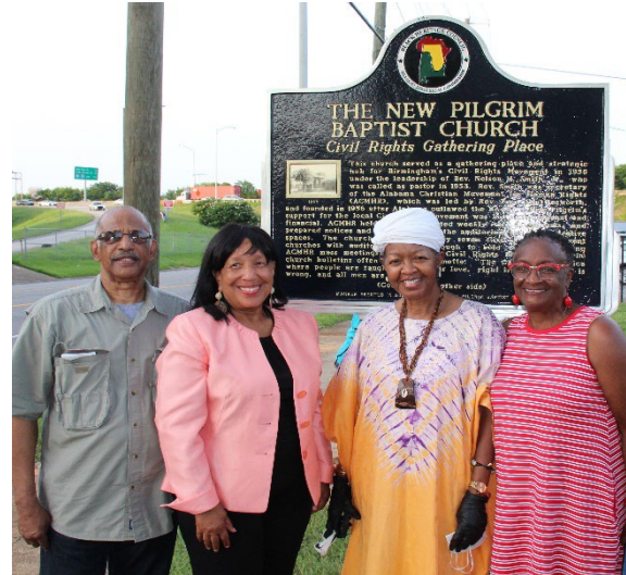
Marker with Photograph (Large 30"h x 42"w)