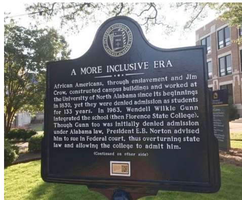
Marker with QR Code