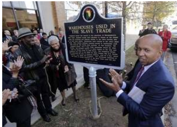
BHC Marker (Large 30"h x 42"w)