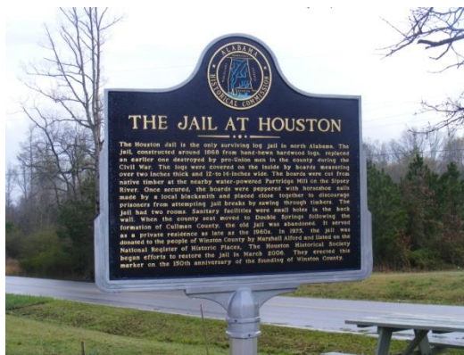
Historical Marker (Large 30”h x 42”w)