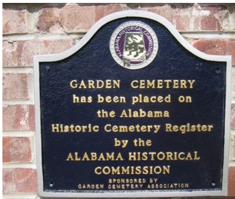
Historical Plaque (16”h x 16.5”w)